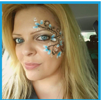
Face Painting by Heidi Sat. & Sun. 12:00 to 4:00 PM You select the design or make a request and the magic begins